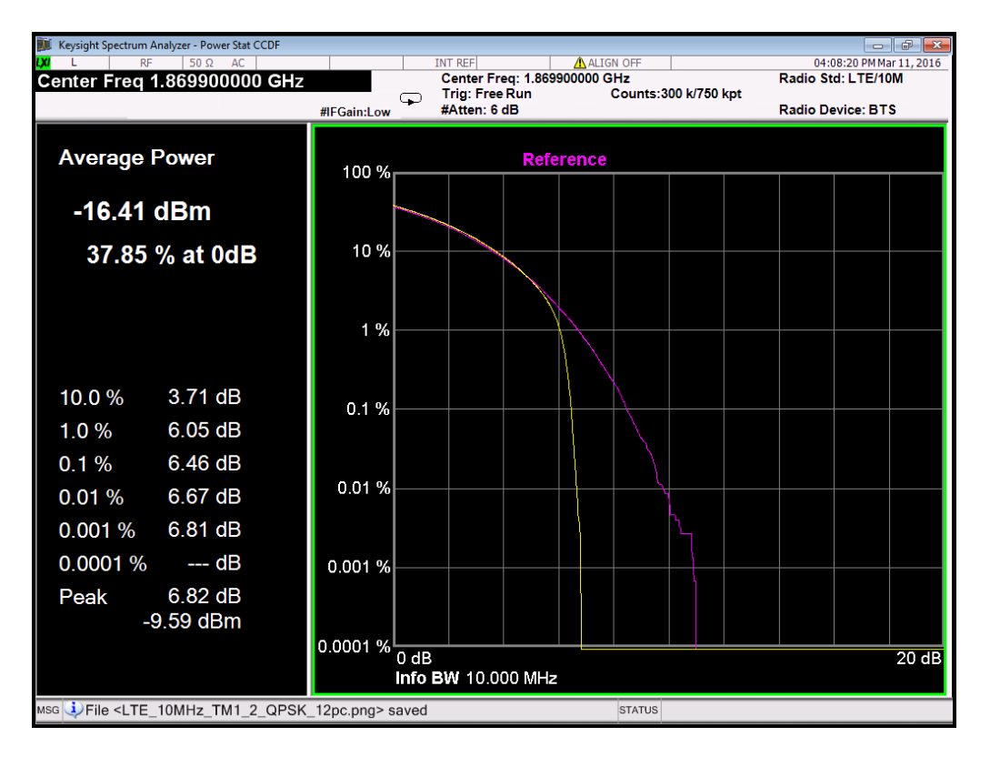
Figure 2: CCDF for 10 MHz LTE, TM1.2 with 12% EVM.

Figure 2 illustrates the Complementary Cumulative Distribution Function (CCDF) before and after the application of FlexCFR at the RFPA output for a single carrier 10 MHz LTE signal.